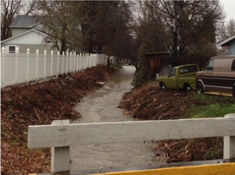
Buchanan Ditch at Linn Road