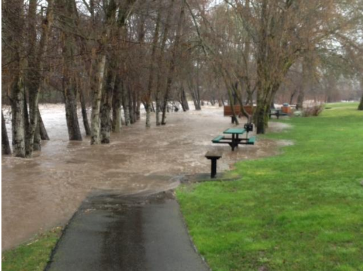
Path at Harnish Wayside Park

The biggest news this week was the storm. Harnish Wayside Park received the most attention due to the high water. The water level at Little Butte Creek was the highest since the storms of December 2005.