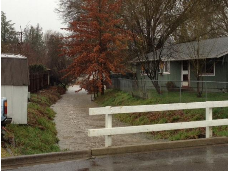
Buchanan Ditch at Elm Way

Harnish Wayside Park Wooden Bridge. The water level increased midway up the rails before receding Friday night.