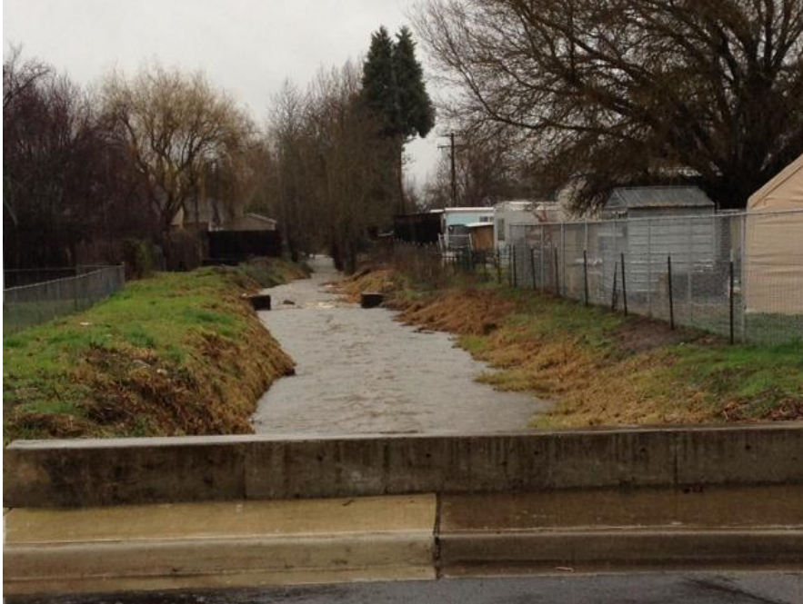
Buchanan Ditch at Fargo Street

The ditch and storm cleaning efforts ensured there was no flooding with the recent storms. In addition to cleaning the storm inlets and outlets into the ditch, Public Works removed a couch, wood, and other debris from the Buchanan Ditch. Several bags of trash were removed by Gomez Yard Services while augmenting the efforts of Public Works to clean the ditches. Over 4 inches of rain was recorded at the Public Works Shop from the weekend storms.